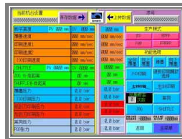
Chinese Recipe Screen