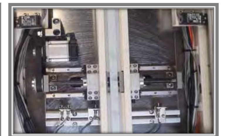
Servo Peel Off